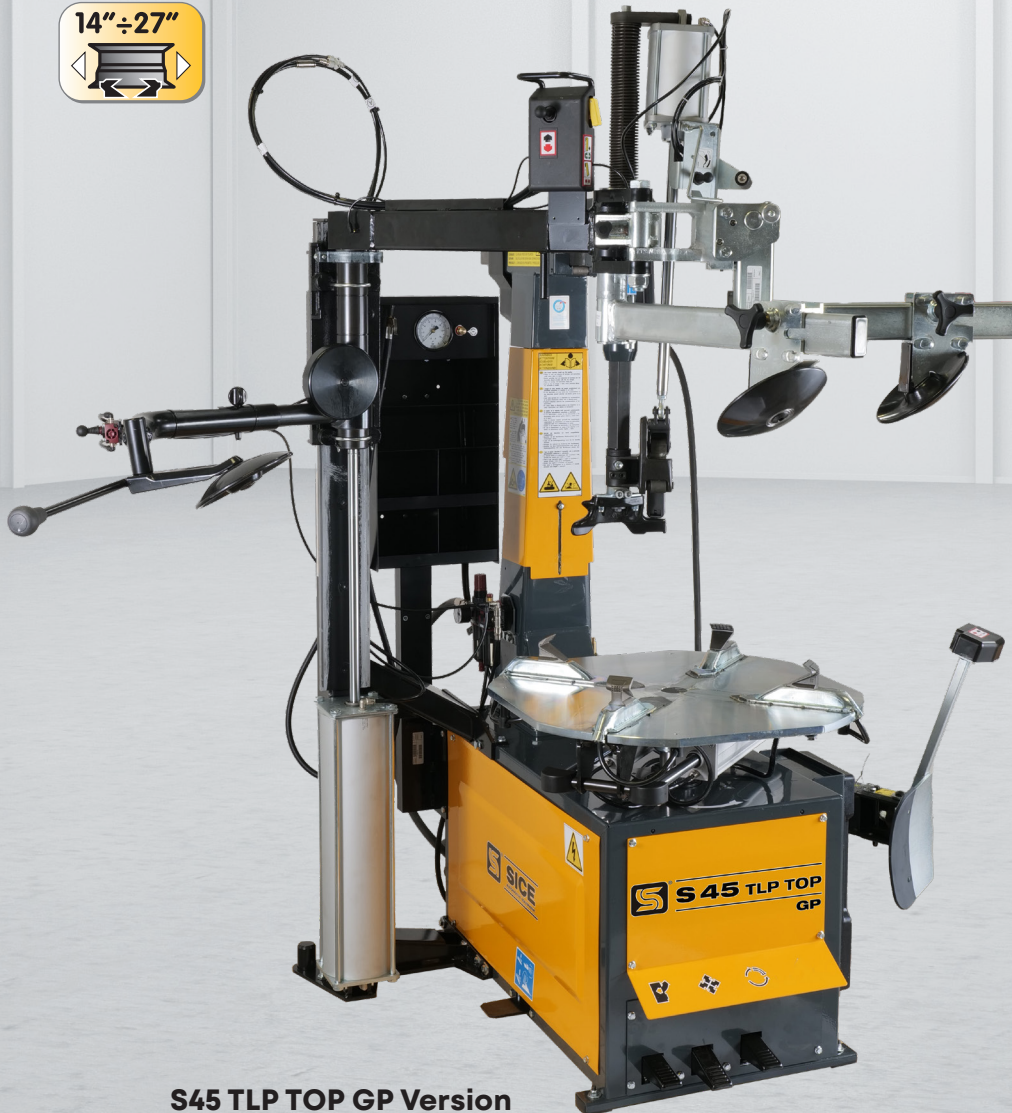
S45 TLP TOP GP Version

Fully equipped 'LevalaLeva' automatic tyre changer